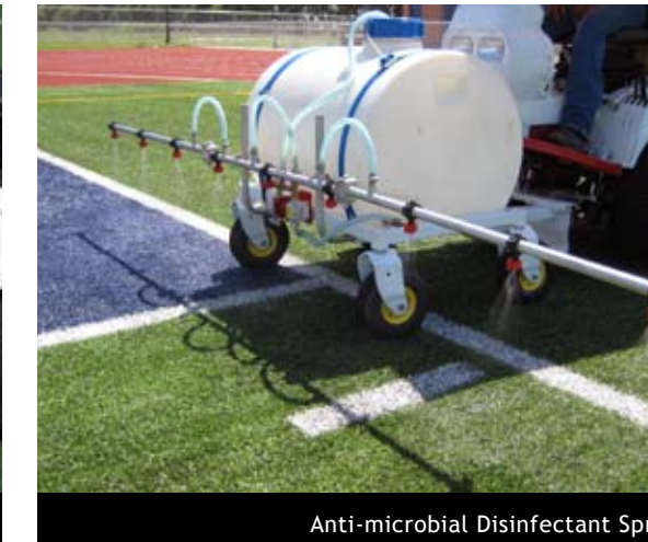
Anti-microbial Disinfectant Spray