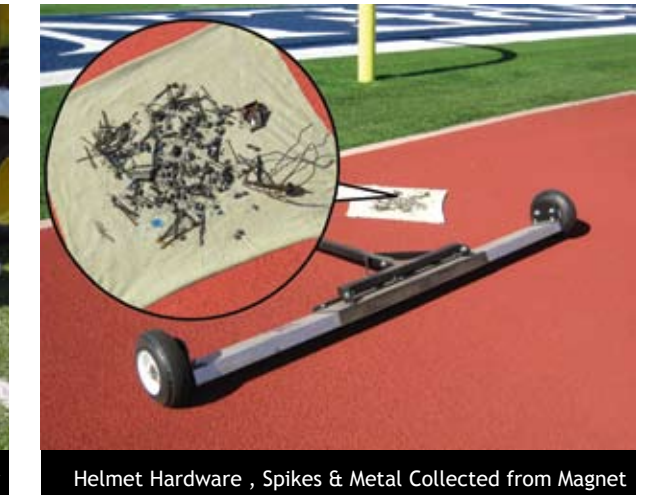
Helmet Hardware , Spikes & Metal Collected from Magnet