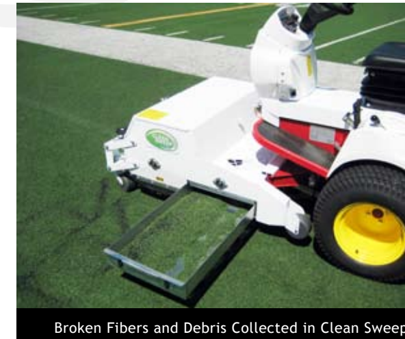
Broken Fibers and Debris Collected in Clean Sweep™