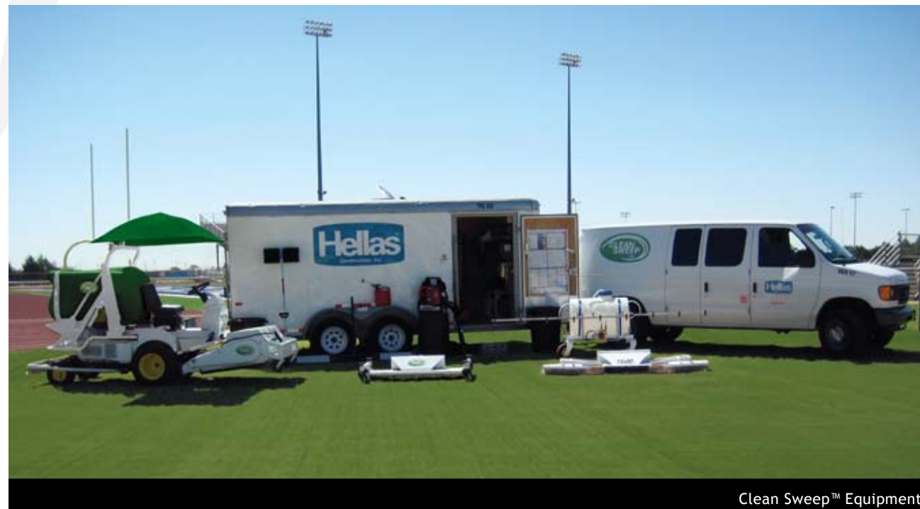
Clean Sweep™ Equipment