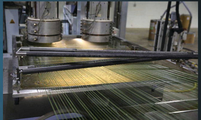
Hellas Fibers, LLC - Dadeville, Alabama

Our experienced fiber extrusion team skillfully handles every strand of fiber that goes into our turf. Hellas Fibers is the starting point of every one of the thousands of fields installed around the country. Our equipment, machinery, and experience ensure our clients receive the highest quality of turf customized to fit each unique specification. Hellas Fibers does not mass-produce for the sake of volume – we manufacture to fulfill customers' requirements.