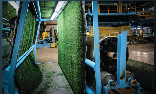
Hellas Textiles, LLC - Chatsworth, Georgia

Our systems are more than just turf. Hellas Textiles houses the machinery and staff expertise required to tuft the turf. Hellas possesses the best technology and experience to manufacture the finest synthetic turf systems in the country. Hellas Textiles manages everything from turf inspection and yarn quality testing through tufting, coating, and delivery of the synthetic turf systems directly to our installation site.