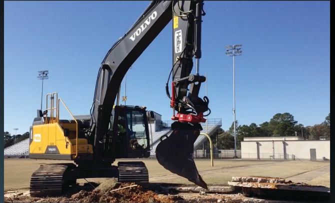
Nacogdoches High School - Nacogdoches, Texas

Every project has a full-time site superintendent who will oversee all activities from ground breaking through closeout. We operate with total transparency and collaboration, plus we ensure our clients have complete access during all stages of construction.